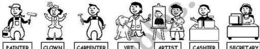
PAINTER CLOWN CARPENTER VET ARTIST CASHIER SECRETARY