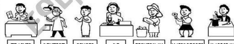
TEACHER DENTIST SINGER DJ FISHERMAN HAIRDRESSER MAGICIAN