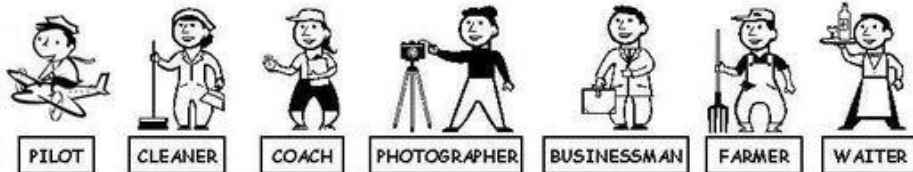
PILOT CLEANER COACH PHOTOGRAPHER BUSINESSMAN FARMER WAITER