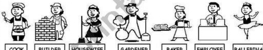
COOK BUILDER HOUSEWIFE GARDENER BAKER EMPLOYEE BALLERINA